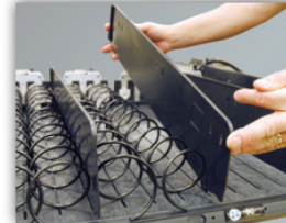
Re-configure trays to almost any package size in the field with no need for tools.